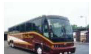
Post Road Tours

Post Road Tours 1105 Strong Road South Windsor, CT 06074 860/644-3484 www.postroadstages.com